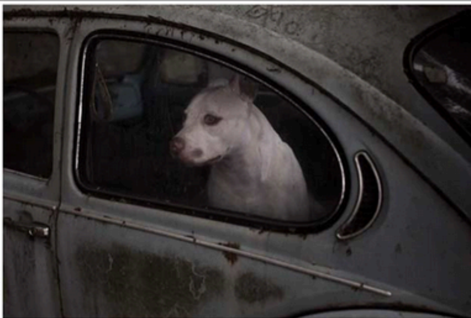
Stan © Martin Usborne